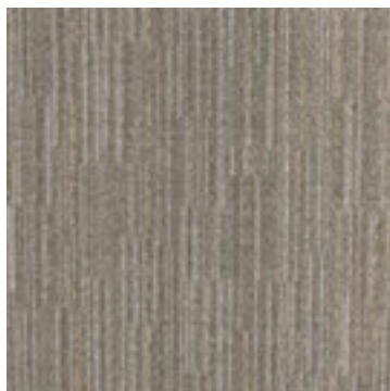
River Rock RCO0001LINE19