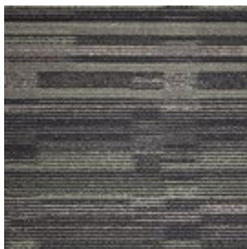
Green Briar RCO0010CUBI19